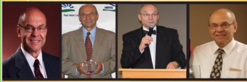
Over 28 Years of Dedicated Service at Stoughton Hospital