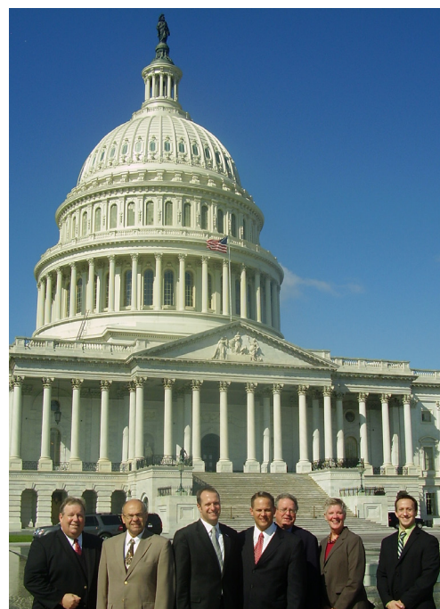
Hospital leaders travel to Washington, DC with WHA to fight against cuts to Medicare, Medicaid.