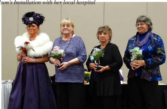
2015 Incoming Board