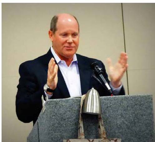
Congressman Reid Ribble spoke about his efforts in improving the lives of those with Alzheimer's Disease.