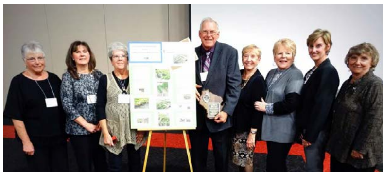
Volunteers in Partnership with Froedtert & The Medical College of Wisconsin Community Memorial Hospital campus, Menomonee Falls