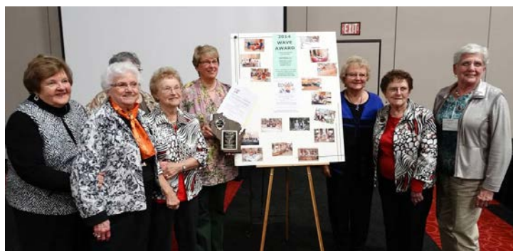
Partners of Beaver Dam Community Hospital, Beaver Dam