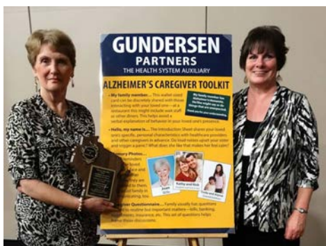
Gundersen Partners, La Crosse