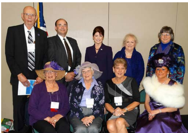
2014 Outgoing Board