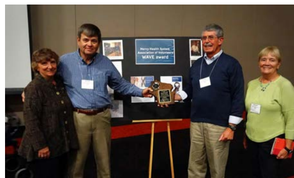
Mercy Health System Association of Volunteers, Janesville