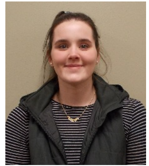
Megan Ross Nursing Floors