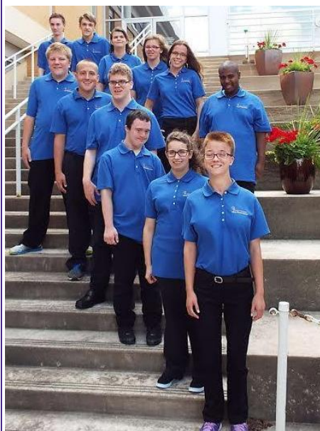
Project SEARCH Students

Project SEARCH is a collaborative employment program between the Oshkosh Area High Schools, Mercy Medical Center, Division of Vocational Rehabilitation, and Goodwill Industries. This program works on improving skills, reaching career goals, and being able to implement these goals in the work field.