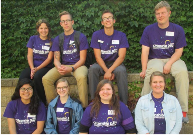
The UW O Citizenship day group

Citizenship Day is an annual project of the UW-Oshkosh Dept. of Residence Life and was held this year on Thursday, August 24, 2017. To demonstrate their commitment to volunteerism, staff of the Residence Life Department volunteered, for an afternoon, at various community organizations to learn more about the community and organizations that utilize students as volunteers. The group that came to Ascension Mercy Hospital, shadowed volunteers in a variety of areas and then spent some time cleaning patient charts.