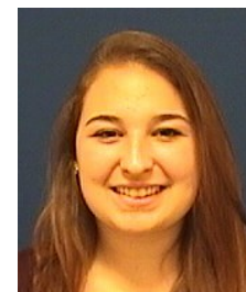
Megan Moore Home Care