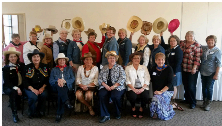
The Western District 2016 Convention Committee and State Officers