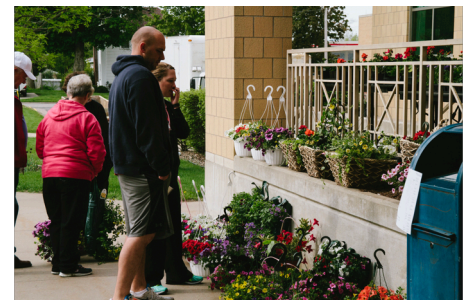
So many choices at our May Geranium Sale!