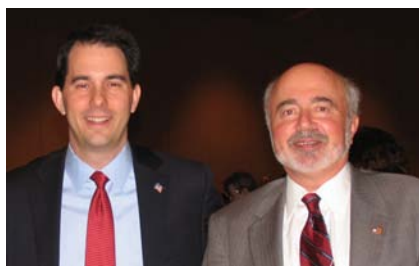
WHA President with one of last year's presenters, Scott Walker, who would go on to be elected Governor in November.