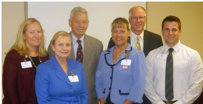
Aurora Medical Center-Manitowoc County and Aurora Sheboygan Memorial Medical Center hospital leaders with Cong. Tom Petri.