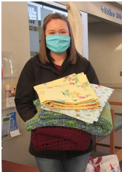
Ice Pak Covers & Blankets donated by Sydney W.