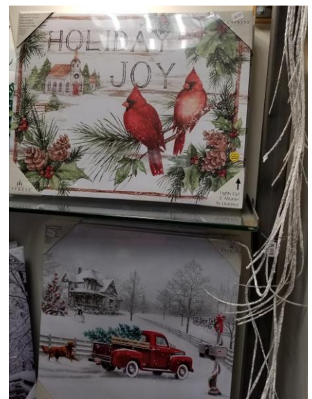
Gift Shop items awaiting purchase