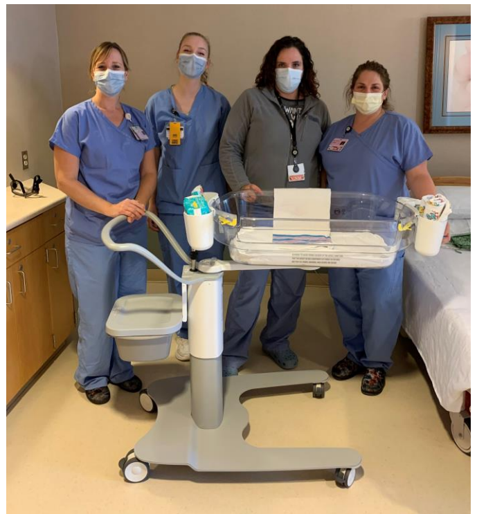
Photo on Right is of Birthplace staff with new sleeper