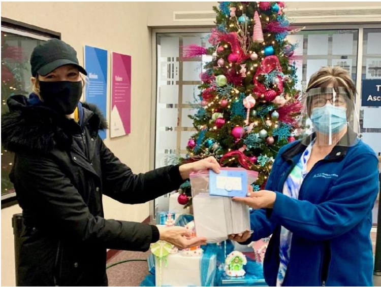
Cards made and donated by Heat 14 Volleyball Club