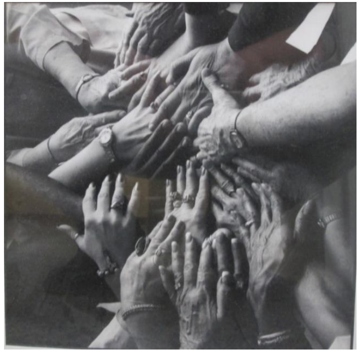
"Alone we can do so little, together so much" -Helen Keller shows the hands of many volunteers at Ascension Mercy