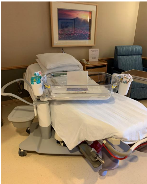
Photo on Left displays the new bassinette swivel sleeper