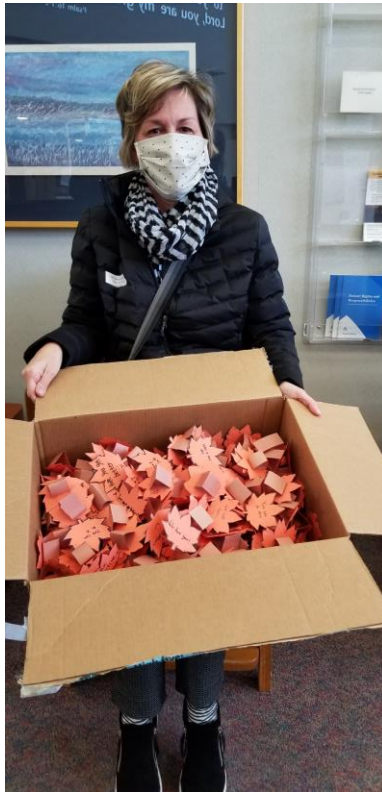
Patient Tray favors by Boarding Academy