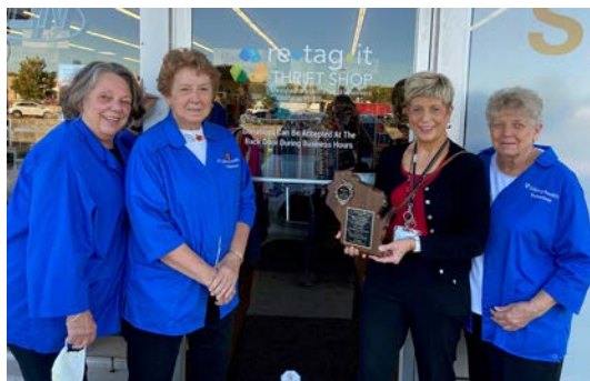
Mercyhealth Association of Volunteers 2021 WAVE