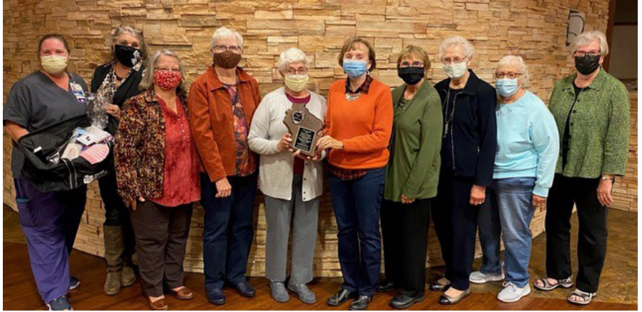
Friends of Vernon Memorial Healthcare with their 2021 WAVE plaque