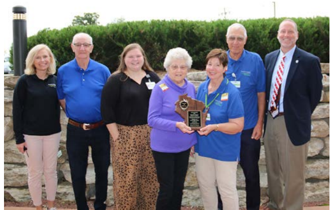
Volunteers of Prairie Ridge Health with their 2021 WAVE plaque